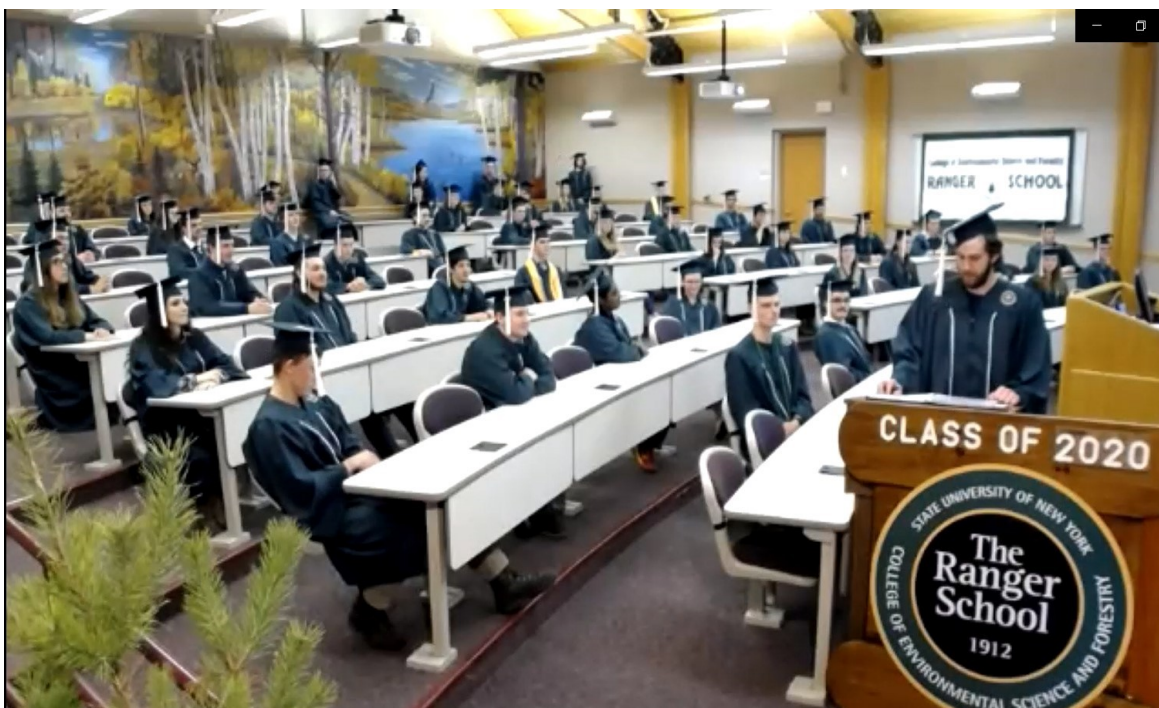
The Ranger School Class of 2020 Graduation Ceremony! One of the few schools IN THE ENTIRE COUNTRY to have an in-person, yet virtual graduation.

Congratulations the Class of 2020! The Ranger School is an experience like no other, and yours was unique in many additional ways as well! Not letting a little thing, like a global pandemic, get in the way of completing your education shows that, as a class, you have truly embraced the principals of hard work and perseverance that are so embodied by the Ranger School. Although we may not be related, but we do all share a special bond as Ranger School graduates. We are honored to welcome you all to the RSAA family and look forward to having a long and wonderful relationship with you all!